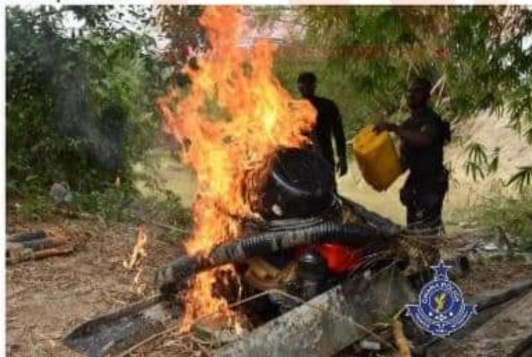
Policemen from Operation Vanguard burning 'Chang Fang' motors