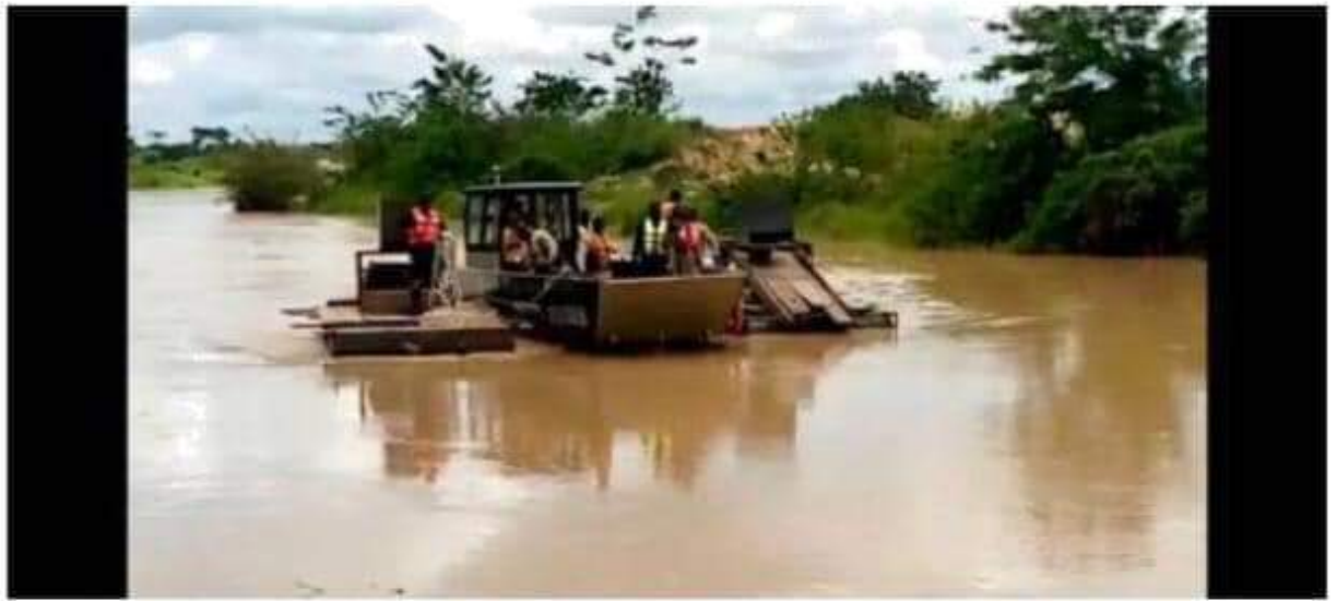
Dredging platform attached to the two sides of the speed boat