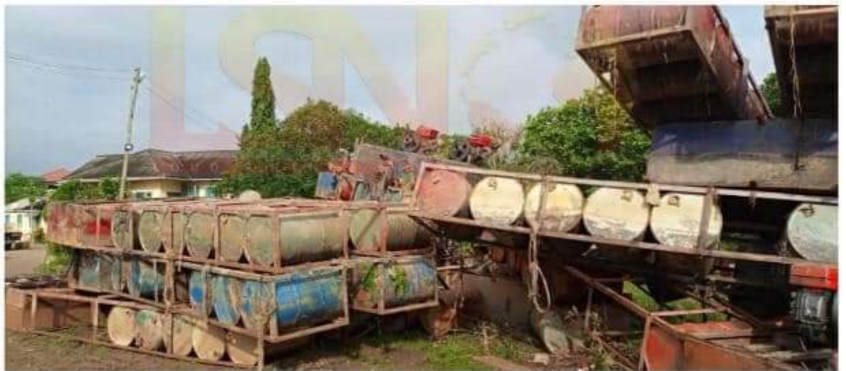
Dredging equipment at a depot far away from mining site